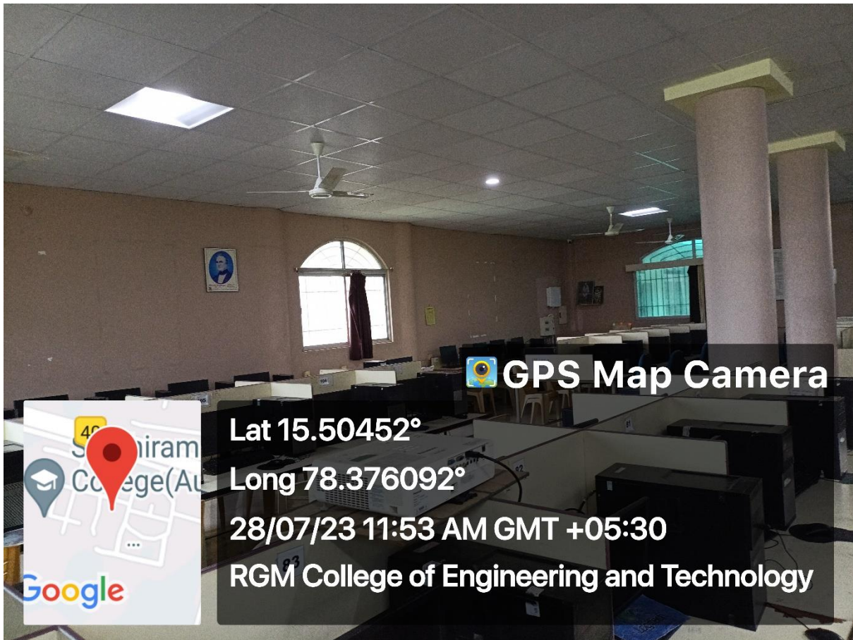
LED Bulbs in the Laboratories