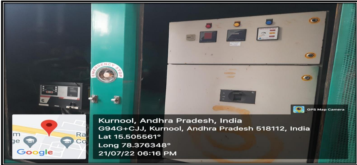
Wheeling to Grid