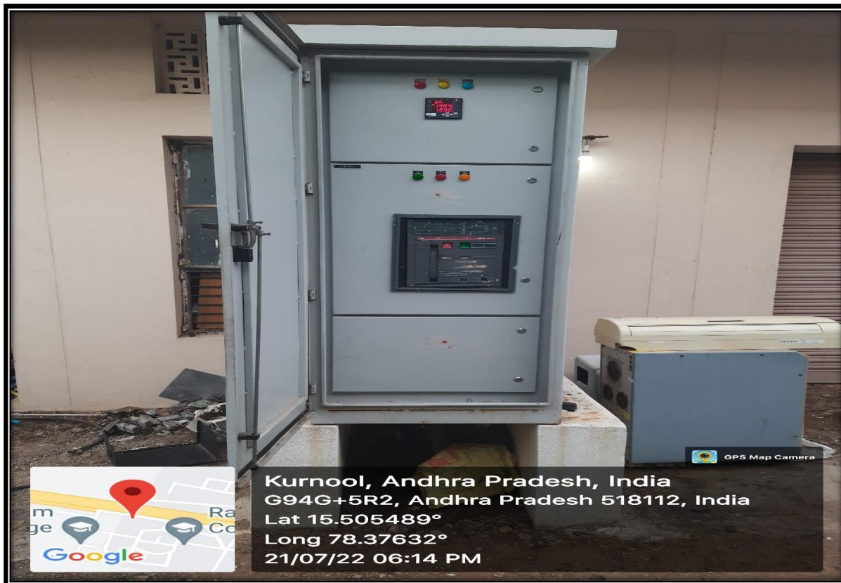
Sensor Based Energy Conservation