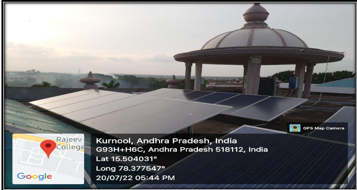
Solar Panels On the Roof top of the College