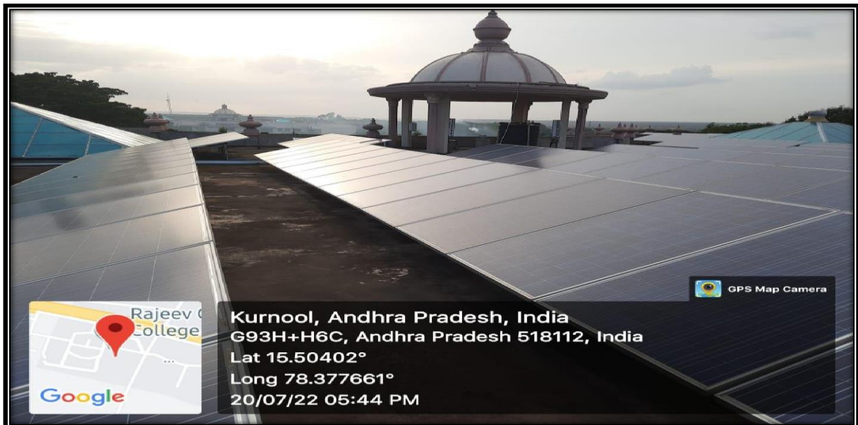
Solar Panels On the Roof top of the College