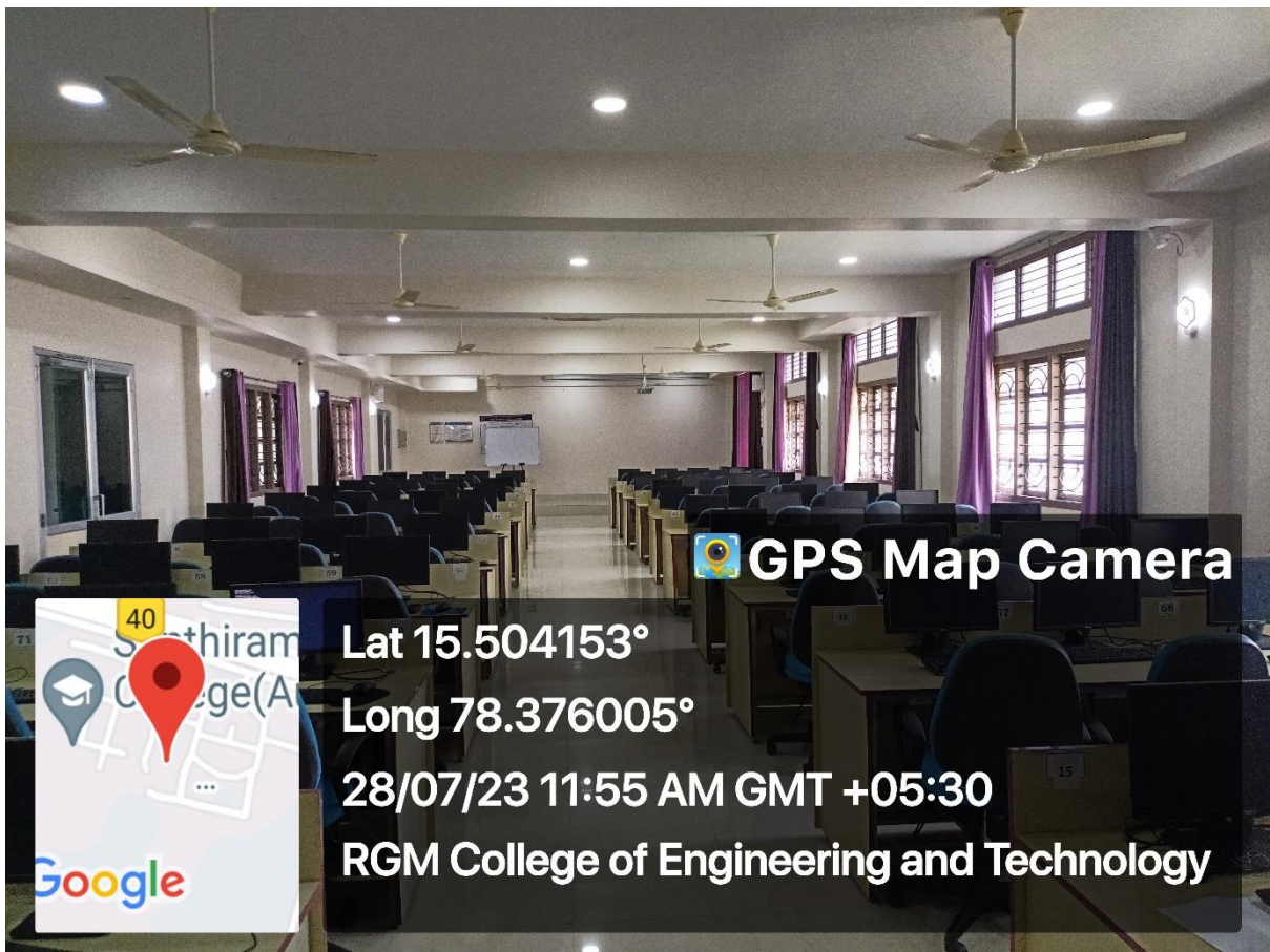
LED Bulbs in the Laboratories