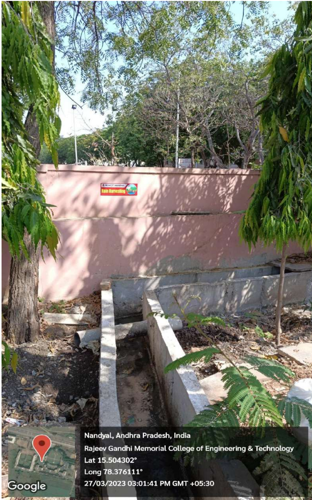
Rain Water Harvesting System