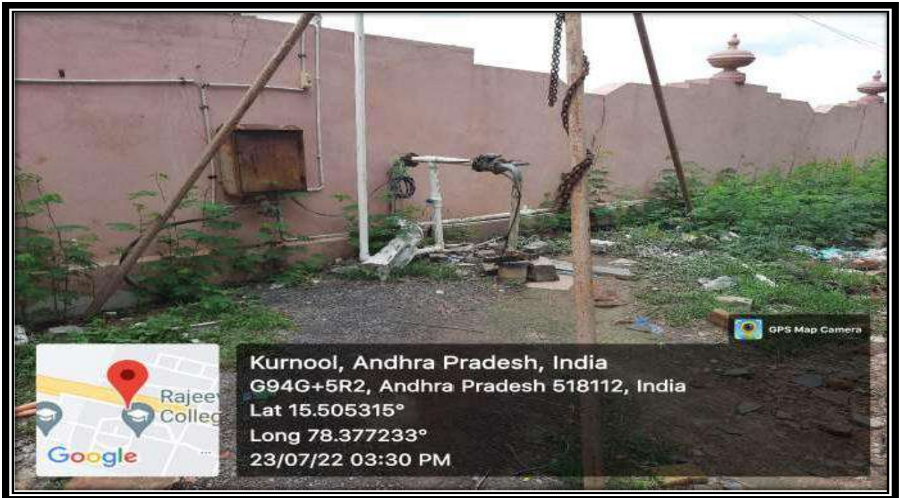
Bore well near the Main Gate