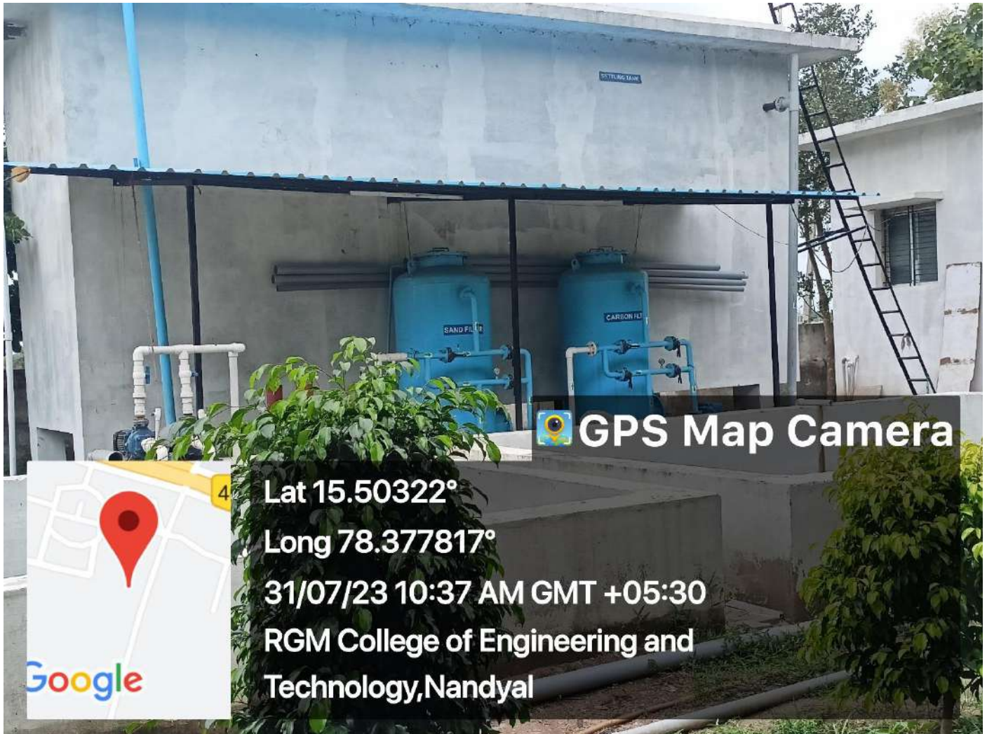
Waste Water Recycling Plant in front of ME Block