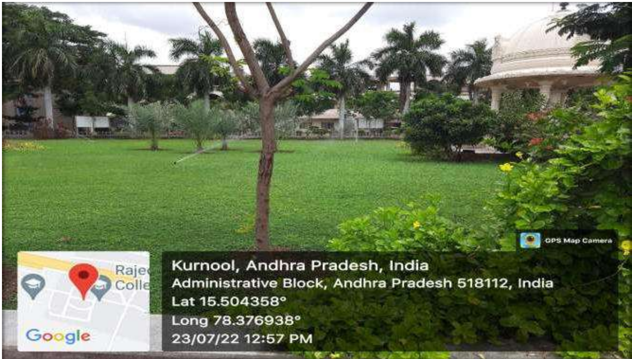
Water Distribution System in the Lawn