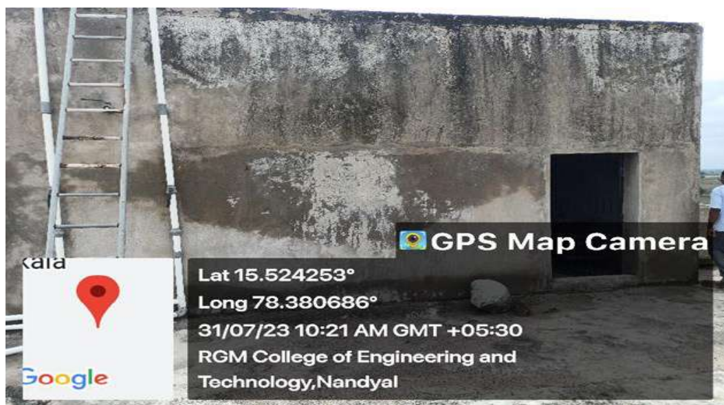
Water Tank on the top of ME Block