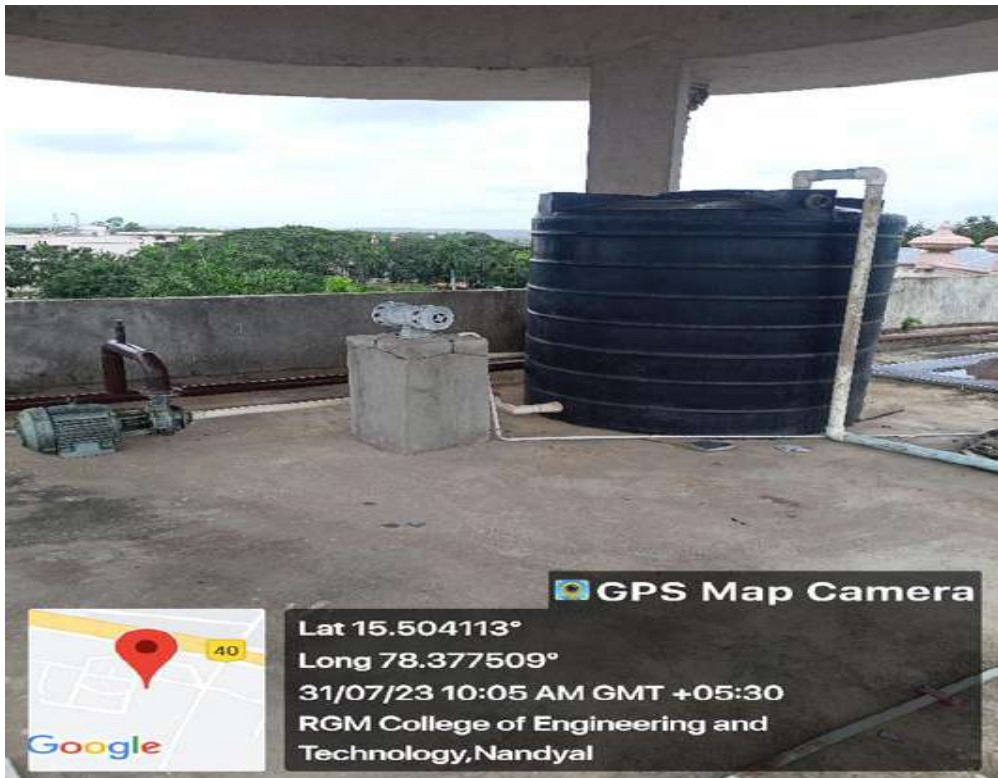
Water Tank on top of RB Block