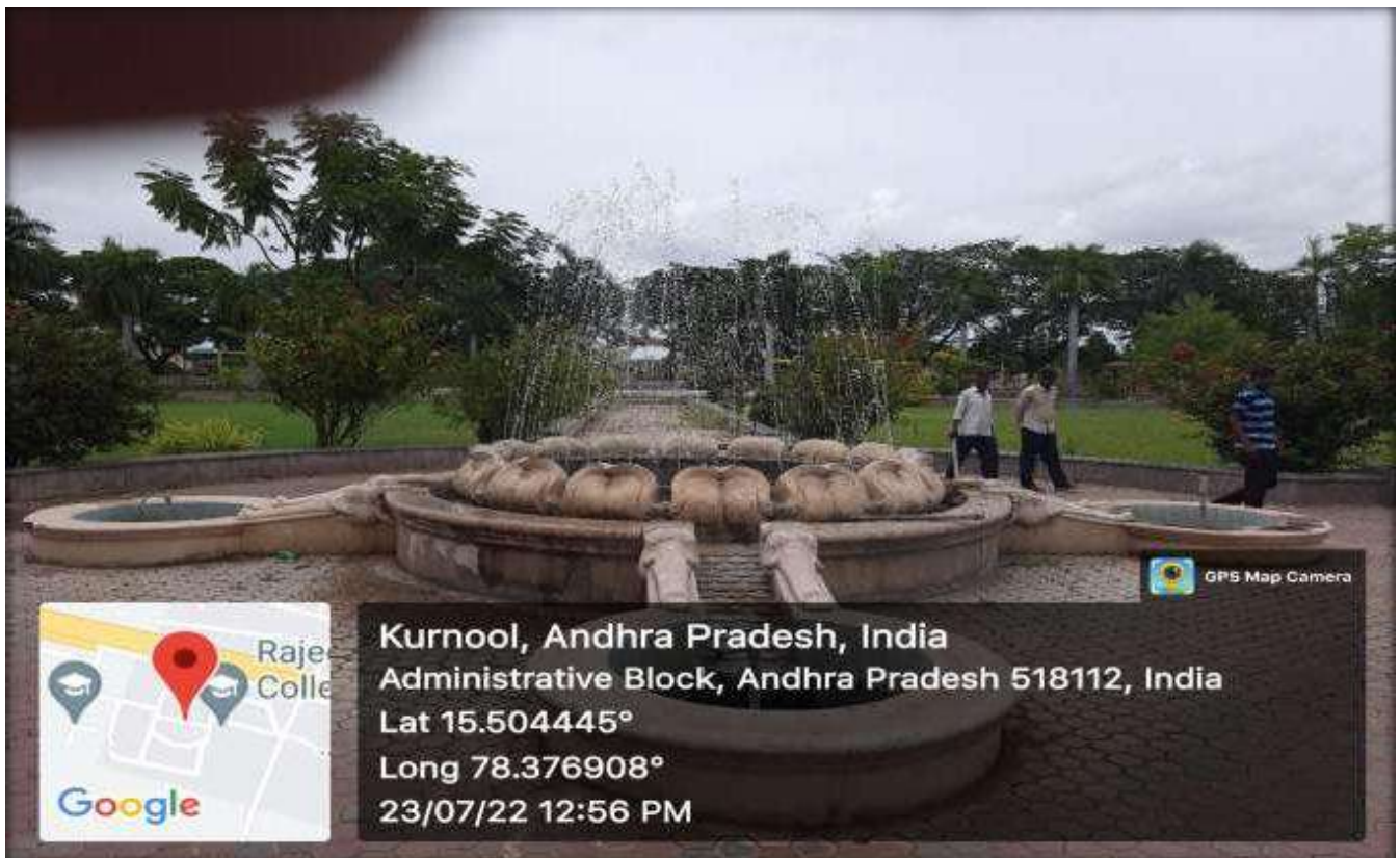
Water Distribution system in the Garden