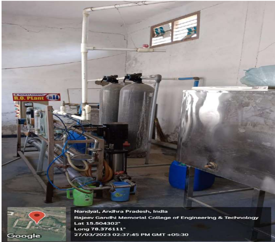
R O Water Plant in the Campus