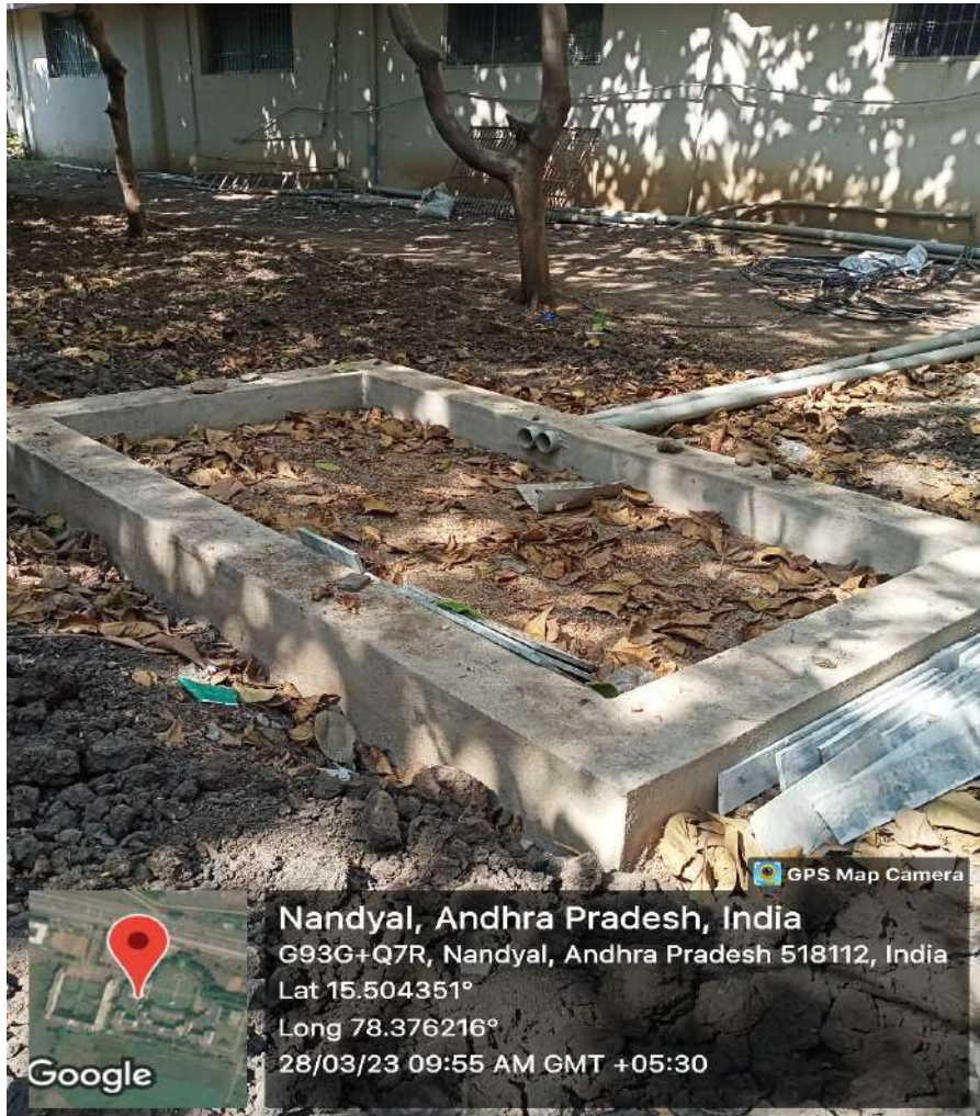
Rain Water Harvesting Unit near the Canteen