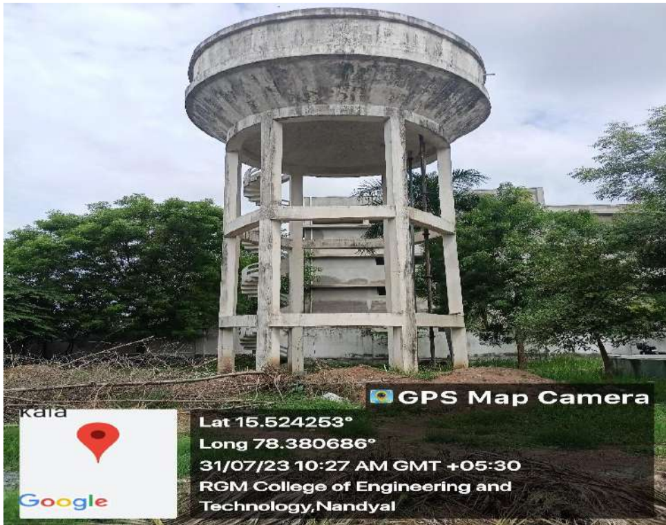
Overhead Tank in front of CE Block