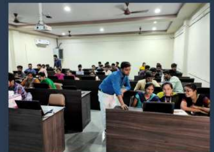
CAD & GIS Lab